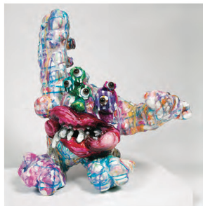
Freaky - detail mixed media on canvas, 19 x 17 x 14 inches,