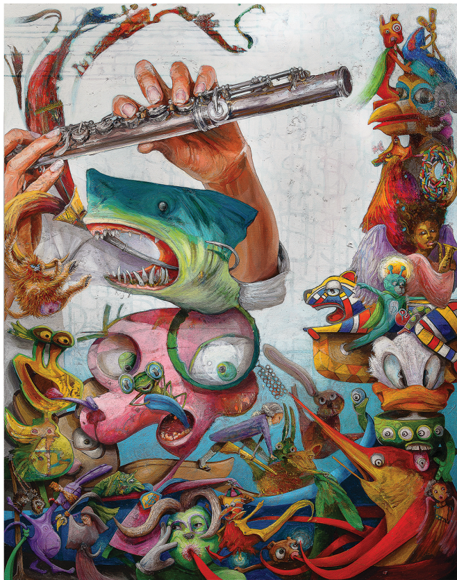
Top Dog acrylic on canvas, 60 x 48 inches, 2015

Front Cover: America's Got Talent acrylic on canvas, 68 x 110 inches, 2016