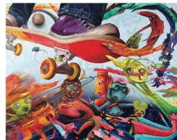
All Stars acrylic on canvas, 48 x 60 inches, 2014